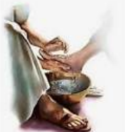
"You should wash each other's feet" (John 13:14).